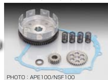
PHOTO : APE100/NSF100

Primary gear ratio : 4.437 (stock : 3.778) Oil pump gear ratio : 2.187 (stock : 1.833)