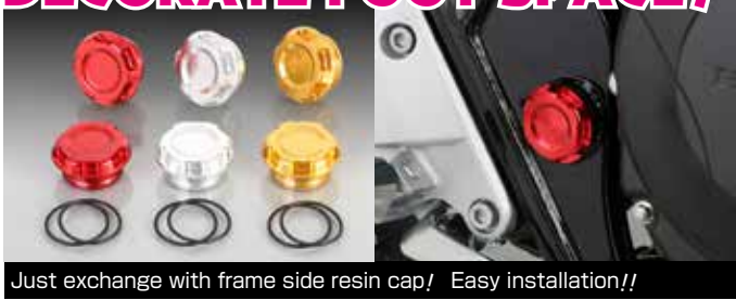
Just exchange with frame side resin cap! Easy installation!!