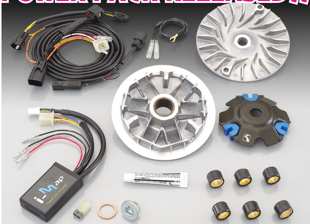
A set of i-map coupler-on set & power drive kit for wide range of acceleration.