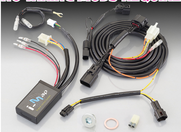
Injection controller to adjust fuel amount for best FI tuning. No wiring mods required to install.