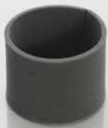
Replacement air element (outer) for stock air cleaner.