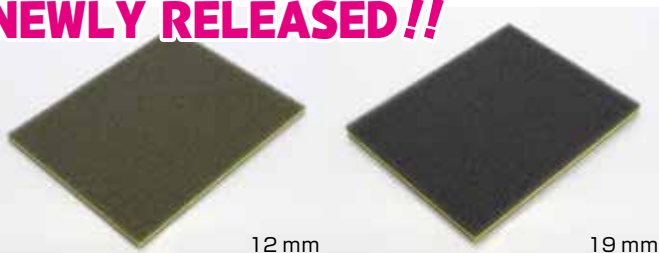
3-layer (rough, middle and fine) air filter for replacement newly released! Cuts according to your needs.