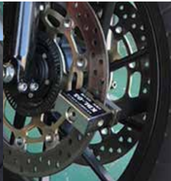
HONDA CB400SF KDL-05