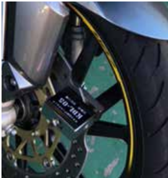
HONDA CBR250RR KDL-05