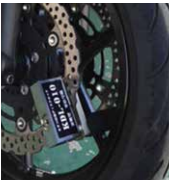
KAWASAKI NINJA400 KDL-10