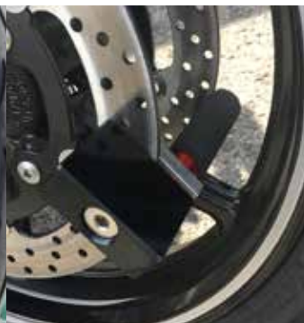
SUZUKI SD650 KDL-05 DL