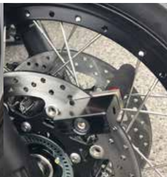
SUZUKI V-STORM1000 KDL-05 DL