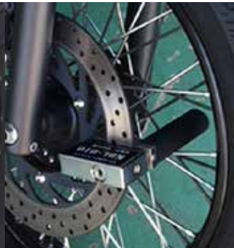
YAMAHA DS250 KDL-10