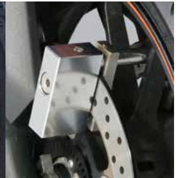
YAMAHA MT-09 KDL-08