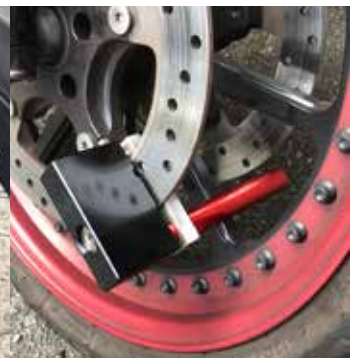
HARLEY-DAVIDSON Night Rod Special (Custom Wheel) KDL-08 DL