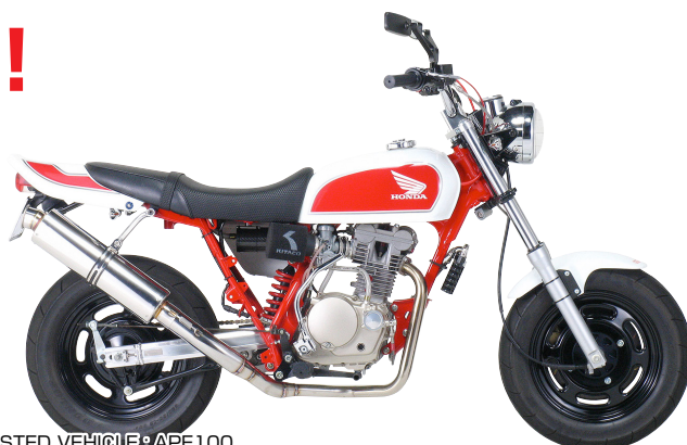
TESTED VEHICLE: APE100

DOHC BIG BORE KIT : 145cc (PWK φ28mm BIG CARBURETOR KIT + POWER REV type2 + HIGH END MUFFLER φ80)