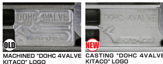
MACHINED "DOHC 4VALVE KITACO" LOGO