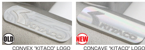
CONVEX "KITACO" LOGO