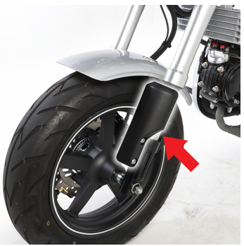
Fork cover protects front fork from small stones.