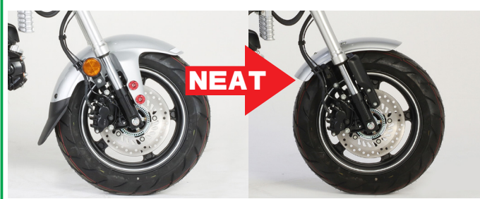
Side reflector not usable