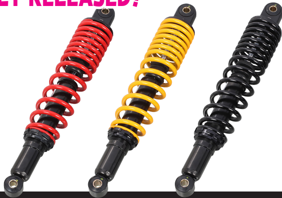
Kitaco rear shock absorber with Kitaco original oil-charged dumper