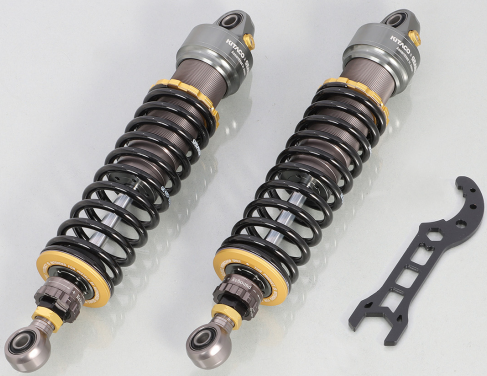
Great performance on street even with lots of luggage. High grade rear shock absorber for comfortability for long-distance touring.