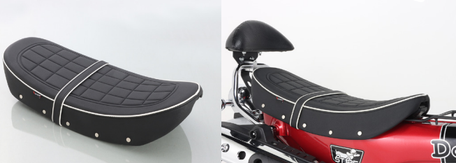
Custom seat that is indispensable for DAX dress-up with piping and rivets on the sides so as not to break the custom style.