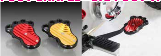
Uniquely designed brake pedal! Aluminum machined big foot!