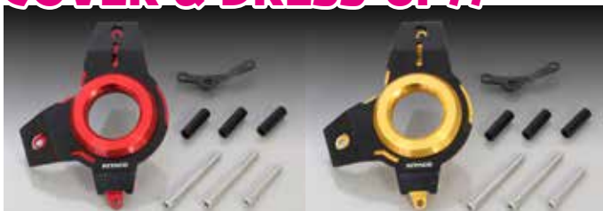
Protects generator cover as well as dress-up. Reduces damages when falling down.