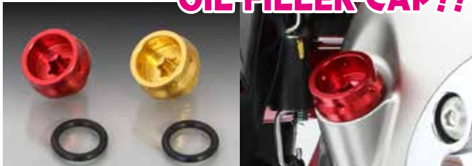
Aluminum machined stylish oil filler cap! Wiring is also possible!