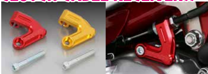
One-point fashionable aluminum machined clutch cable receiver!