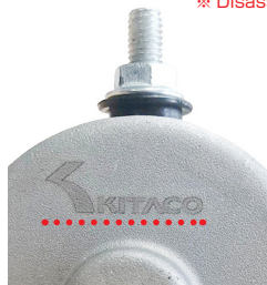
KITACO LOGO PRINTED