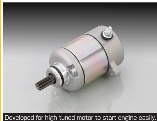
Developed for high tuned motor to start engine easily.

FOR HIGH-TUNED MOTOR TO START ENGINE EASILY!!