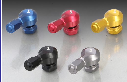
Sideway air valve for tubeless wheel. Made from aluminum for durability and custom.

ALUMINUM MACHINED AIR VALVE NEWLY RELEASED!