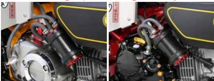
STOCK CLUTCH COVER + OIL CATCH TANK CLUTCH COVER KIT + OIL CATCH TANK

Down muffler exchange required when using it on Monkey 125.