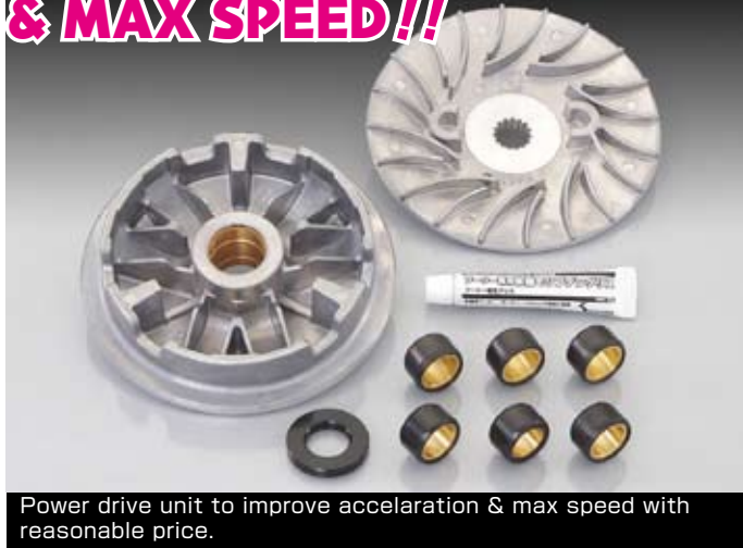
Power drive unit to improve acceleration & max speed with reasonable price.