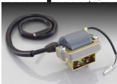
Replacement ignition coil (type A) is newly released !!

IGNITION COIL FOR 6V MONKEY NEWLY RELEASED!!