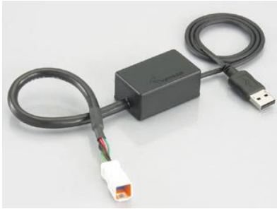
PC INTERFACE CABLE 763-0500900

*For Windows (Does not respond to Macintosh)