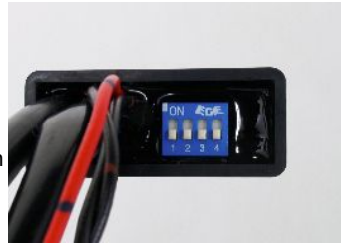
4 DIP SWITCH

Three channels pre-installed with best fuel injection map for stock and KITACO parts. User can set up original fuel injection map to make it responsive another parts by the other channel.