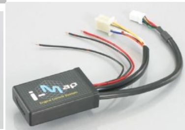
KITACO i-Map 763-1135000

*PC INTERFACE CABLE is required to update the original map.