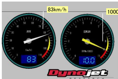
Test result of engine rev and max speed when installed bellow parts